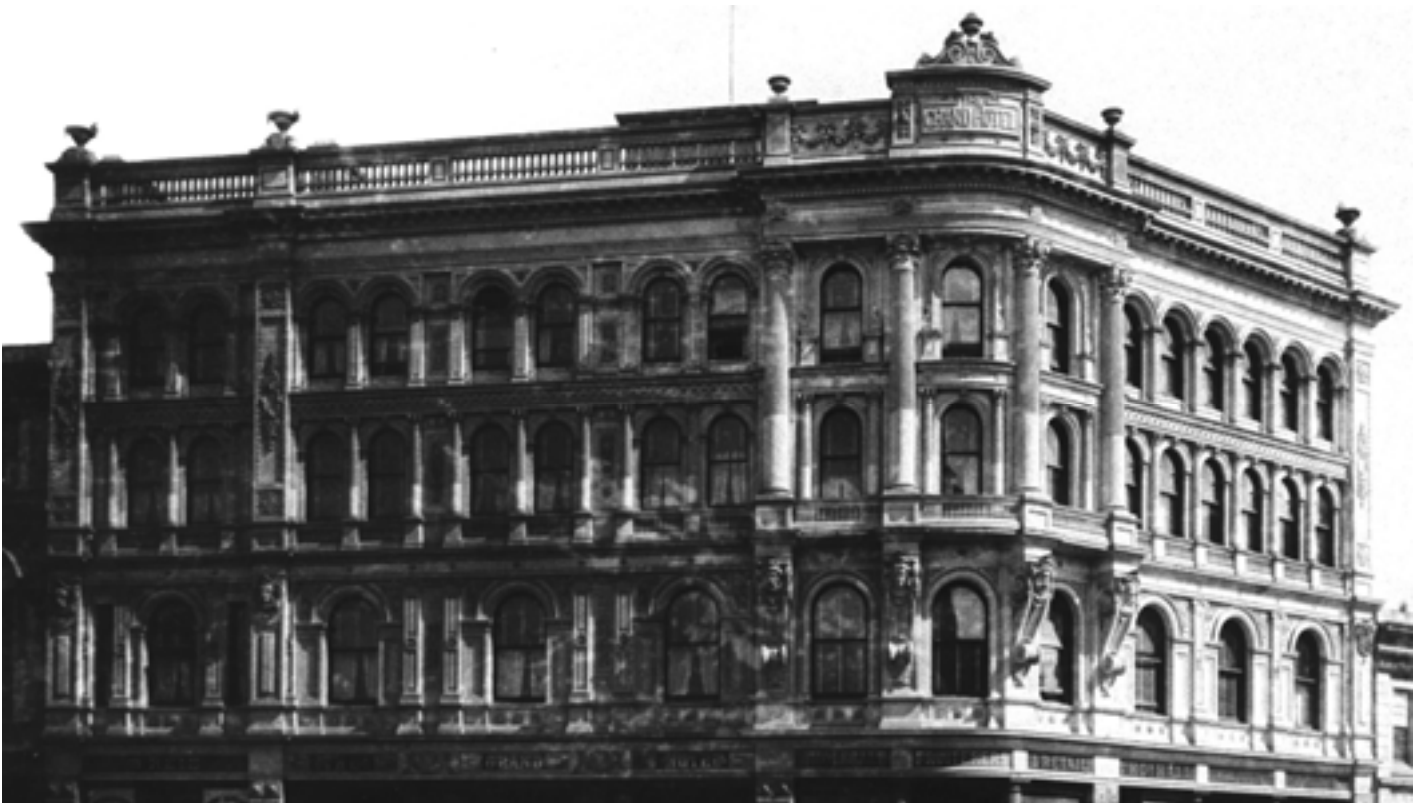
Grand Hotel, DUNEDIN ca1880. C/N E1988/39.

Cnr Anzac Ave & Parry Street, PO Box 56, DUNEDIN / ŌTEPOTI 03 479 8868 ph :: 03 479 5078 fax reference.hocken@library.otago.ac.nz http://www.library.otago.ac.nz/hocken/index.html