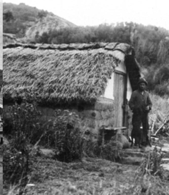
Prospector's Hut, Terrytown near Beaumont ca 1890. S06-443a